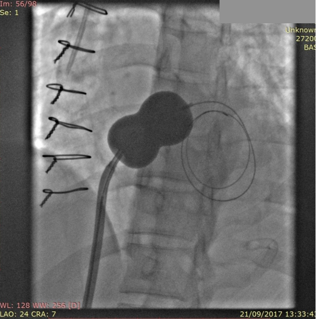
Fig 2.: After inflation of balloon